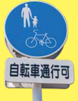
▲ "Bicycles Allowed" sign