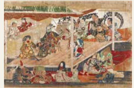
Okuni Kabuki Sōshi (part), Momoyama period, early 17th century, Important arts, The Museum Yamato Bunkakan

This exhibition examines the power of clothing through various cross-dressing cultures and expressions in Japan from ancient times to the present. Where do the boundaries between men and women lie? What does it mean to transcend these boundaries? What are masculinity and femininity? By tracing a part of cross-dressing history in Japan, we will explore how it has been expressed and think about the past and future of cross-dressing.