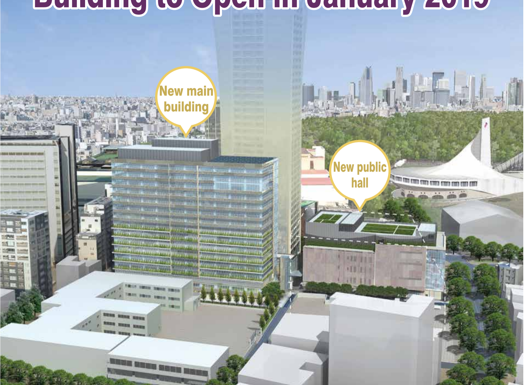
Artistic rendering of the completed main building and surrounding area

The city's new main building will be completed in October 2018, and open in January 2019. It will combine a design reflecting the vibrant atmosphere of Shibuya City and a color palette expressing diversity, and integrate the three buildings on the site through texture and harmony with the surrounding environment.